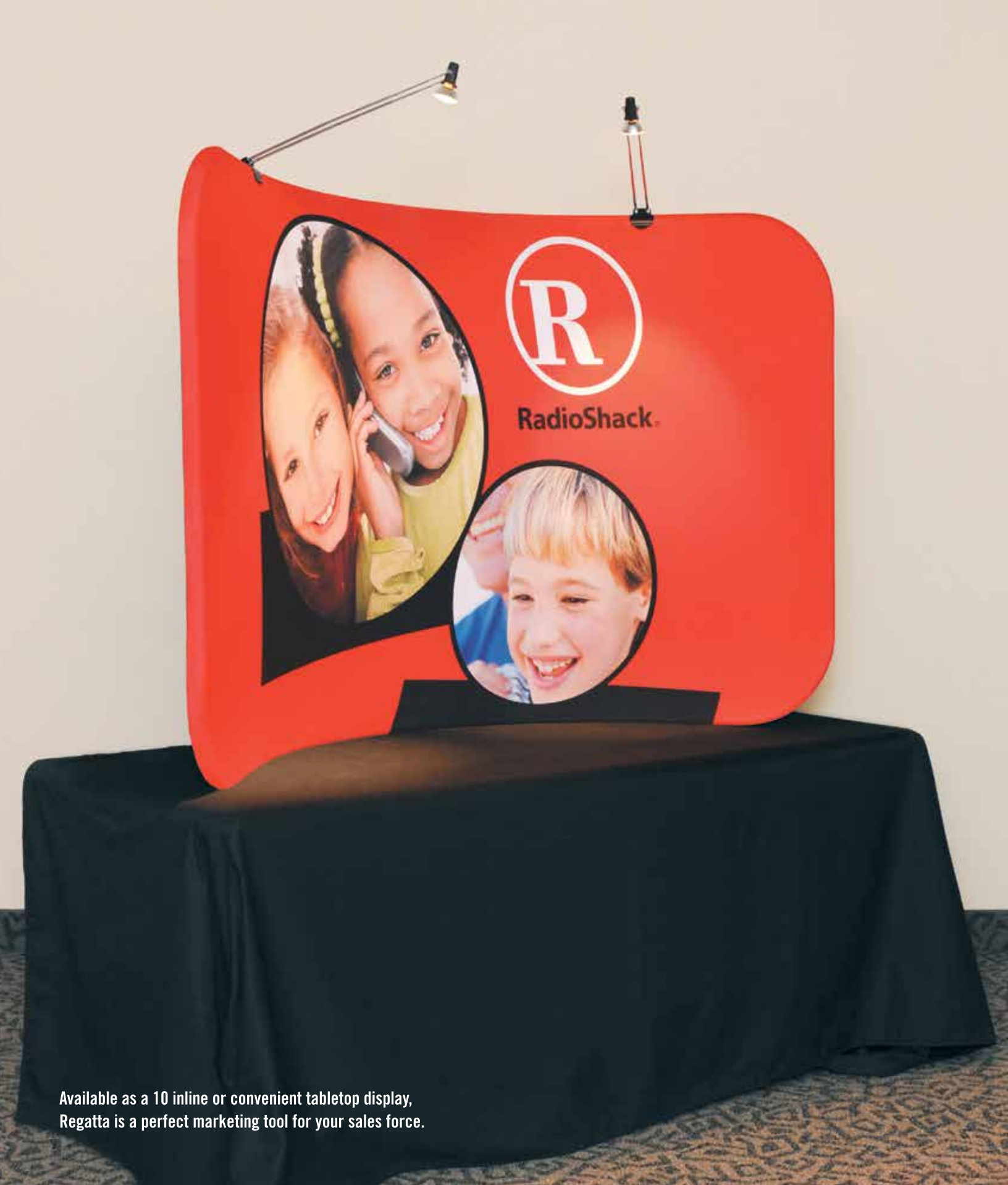
Available as a 10 inline or convenient tabletop display, Regatta is a perfect marketing tool for your sales force.