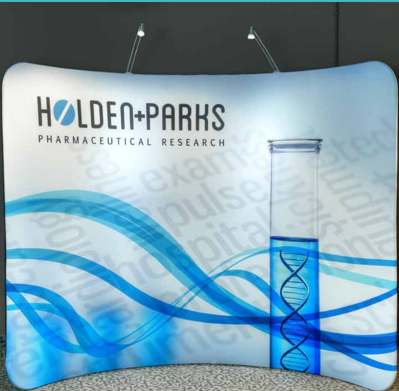
Regatta® Exhibit System Frame and Fabric Display